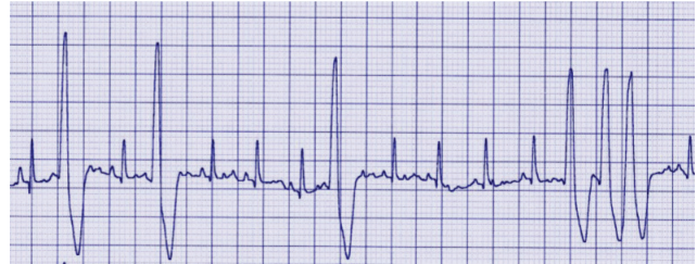
Figure 2 Three lead ECG consistent with right sided origin ventricular premature beats which is commonly noted in dogs with ARVC. This rhythm can be particularly dangerous and may progress to a life threatening arrhythmia.